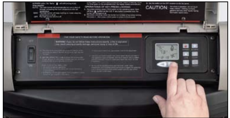
Touch Pad Controls

HearthRite radiant models are available in 6,000; 10,000; 15,000; and 25,000 Btu LP and in 6,000; 10,000; 18,000; and 30,000 Btu Natural Gas Manual and thermostat.