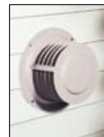
Shown: Standard Direct Vent Cap mounted on outside wall

DVC-35 and DV-55 models are design certified in accordance with American National Standards Institute Z21.86 (latest standard) and CSA.2.32 (latest standard) by the Canadian Standard Association, as Fan Type Direct Vent Wall Furnaces.