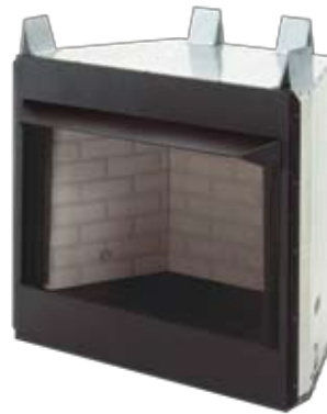
The BV36B is a 36" Smooth-faced Model with Concrete Refractory Brick Liner.