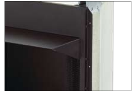
Standard Features Include Heat Deflection Hood, Operable Chain Mesh Spark Screens and Full Length Nailing Flanges.