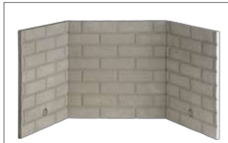
Optional Accessory Brick Lining Kits are Available in both Ceramic Fiber and Refractory Concrete Versions.