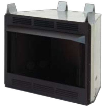
The BV42L offers Louver-faced Feature for Warm Air Circulation