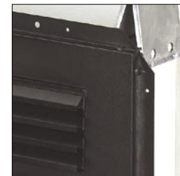
Cottages install straight and secure every time thanks to full length drywall stop style nailing flanges.