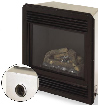
CD36RN is our rear vented model configured for natural gas.