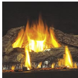
Cottage models feature full, random flame patterns and glowing ember bed burners.