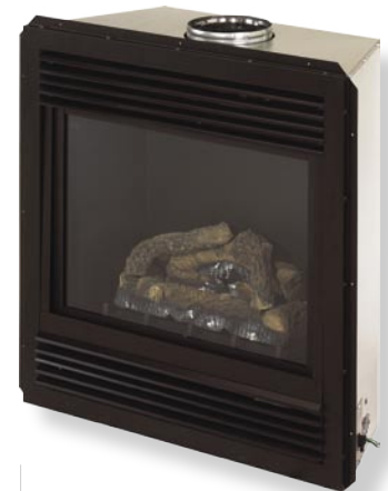
CD36TP is our top vented model configured for propane.