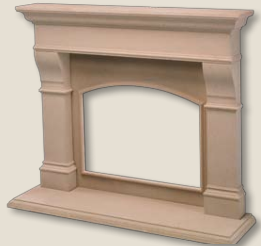
The Montecito is ordered in components featuring separate leg set, mantle, face plate and hearth extension.