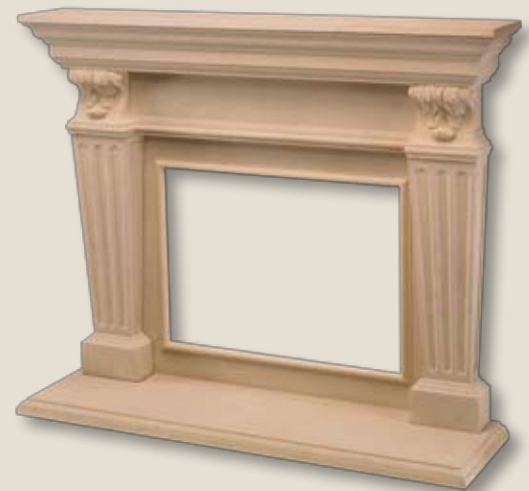
The Marin is ordered in components featuring separate leg set, mantle, undermantle, face plate and hearth extension.