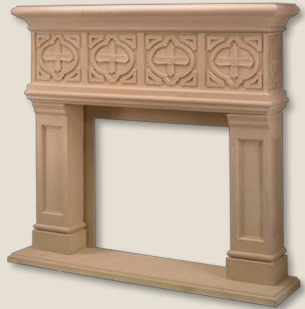
The Monterey is ordered in components featuring separate leg set, mantle, undermantle, face plate and hearth extension.