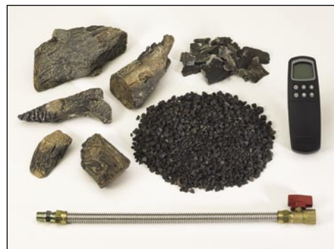
Standard feature components include hand-held, multi-function remote control