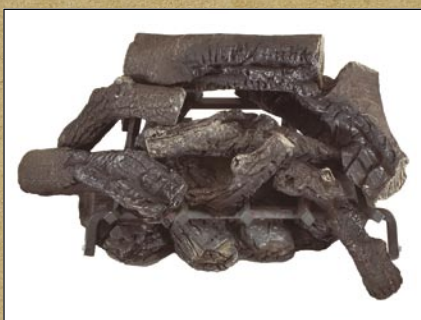
Solid, unitized log arrangement is intricately detailed.

Design Dynamics goes above and beyond when it comes to safety of our products. In addition to industry-leading, clean flame combustion technology, the Hardwood includes a millivolt safety gas control with multi-function remote, and matchless, piezo ignition. The control and gas train are 100% factory assembled and tested.