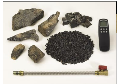
Standard feature components include hand-held, multi-function remote control