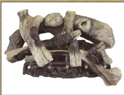
Solid, unitized log arrangement is intricately detailed.

Design Dynamics goes above and beyond when it comes to safety of our products. In addition to industry-leading, clean flame combustion technology, the Kentucky Elm includes a millivolt safety gas control with multi-function remote, and matchless, piezo ignition. The control and gas train are 100% factory assembled and tested.