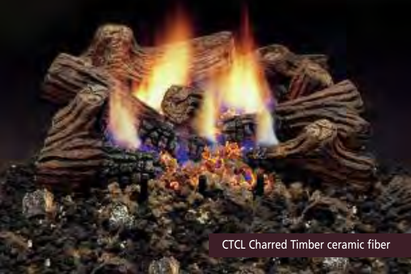
CTCL Charred Timber ceramic fiber