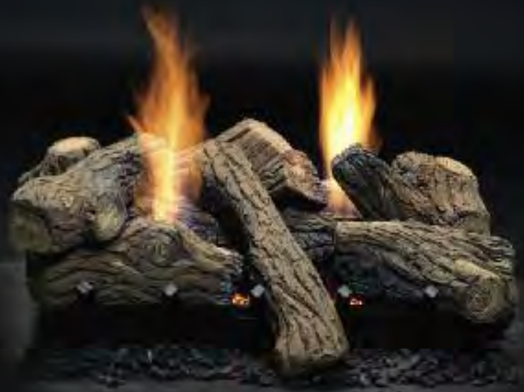
NBST27 Natural Blaze See-Thru ceramic fiber