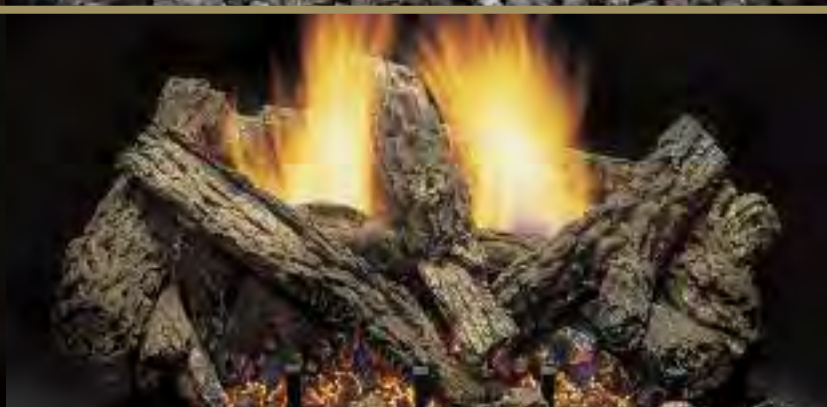
KSCL Ember Bed Kentucky Stack ceramic fiber