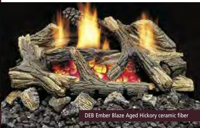
DEB Ember Blaze Aged Hickory ceramic fiber