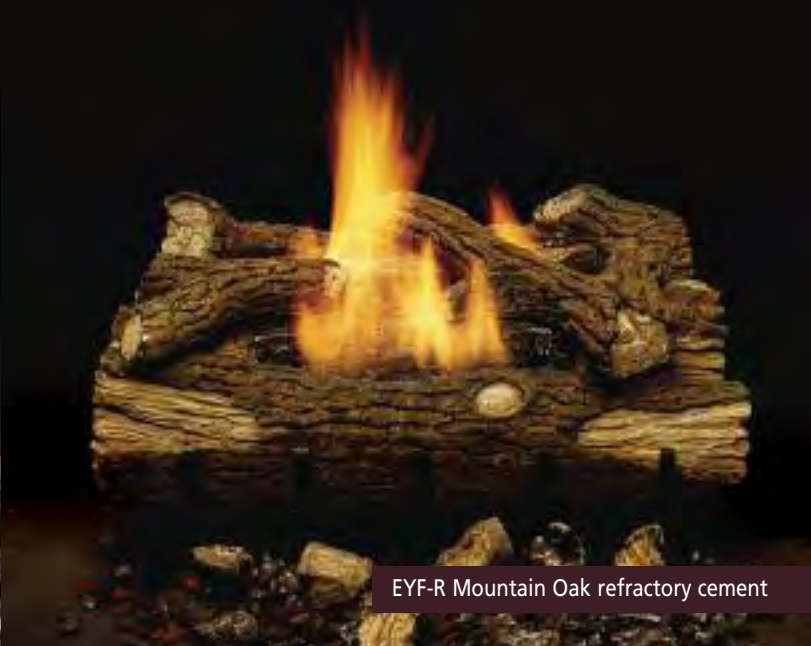
EYF-R Mountain Oak refractory cement