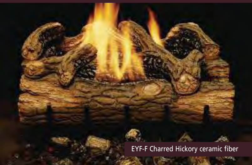
EYF-F Charred Hickory ceramic fiber