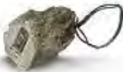
Log switch with 12" wire