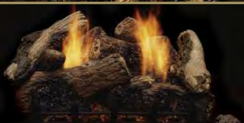
BO-R Berkley Oak refractory cement. Berkley Oak available in refractory cement and ceramic fiber models. Refractory cement image is shown.