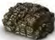
Ember remote receiver cover