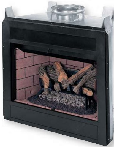
M36B features textured refractory brick-lined interior.