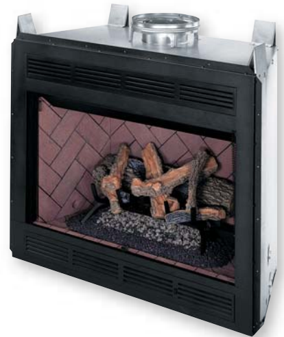
M42H (shown with optional stamped steel louvers) features herringbone textured refractory brick-lined interior.