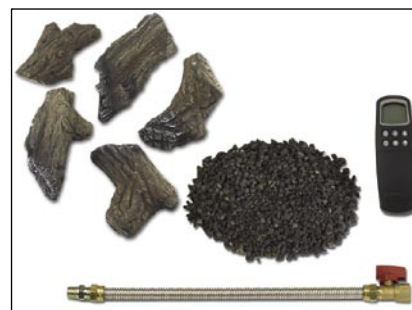
Standard feature components