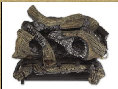
Solid, unitized log arrangement is intricately detailed.