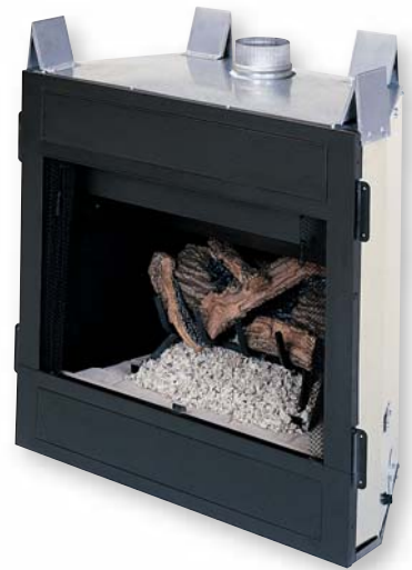
P325 features premium multi-dimensional gas logs and glowing ember bed; vents with 5" b-vent.