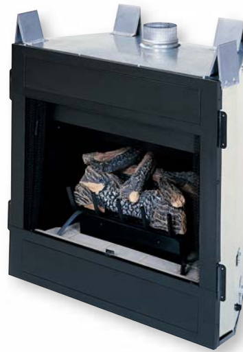
P324 offers millivolt ignition; vents with 4" b-vent.