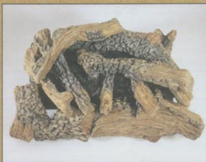
Solid, unitized log set is intricately detailed