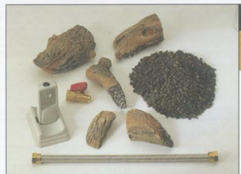
Standard feature components include hand-held remote control