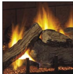
Tudor models feature random flame patterns and beautiful glowing ember bed burners.