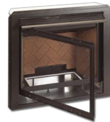
Hinged tool-less entry glass door swings open for easy maintenance and never needs adjustment.