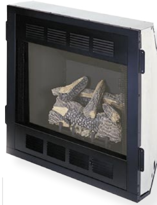
T32N-A includes attractive stamped steel louvers and textured powder coat finish