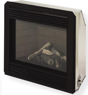
TC36N features premium rolled louvers with millivolt ignition new ungraded logs and burner