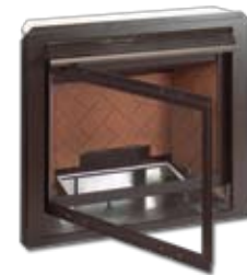
Hinged tool-less entry glass door swings open for easy maintenance and never needs adjustment.