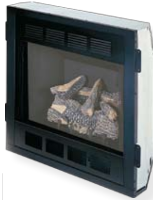
T32N-A includes attractive stamped steel louvers and textured powder coat finish