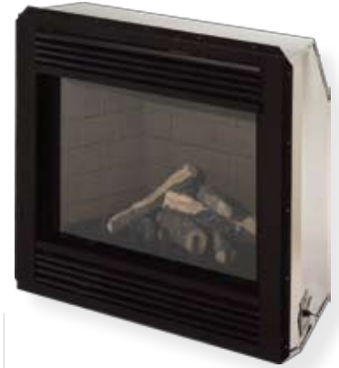
TC36N features premium rolled louvers with millivolt ignition new ungraded logs and burner