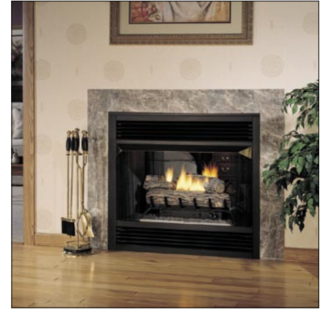
See thru model