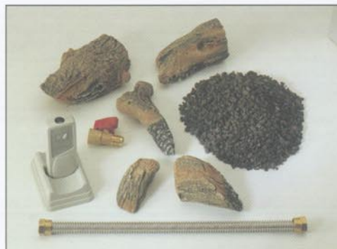
Standard feature components include hand-held remote control