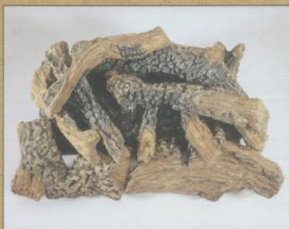
Solid, unitized log set is intricately detailed