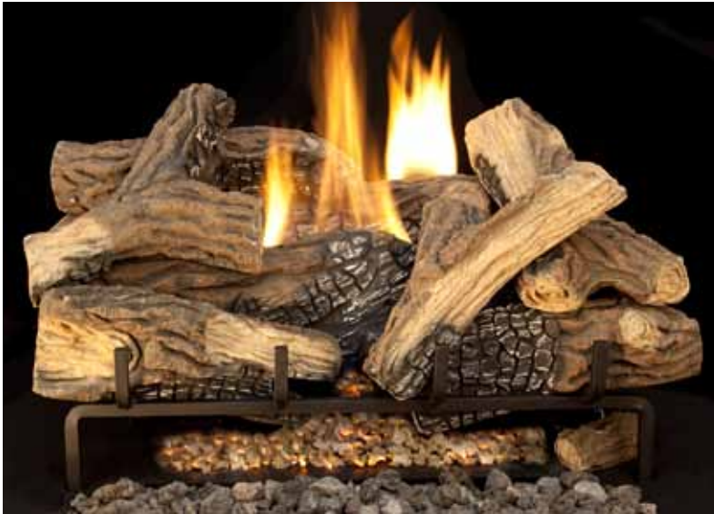
24" Scarlet Oak

Pair a LogMate with any of these attractive Vantage Hearth Vent-Free Gas Log Heaters.