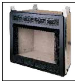
LogMate Firebox, circulating