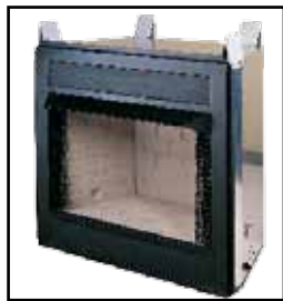
LogMate Firebox, non-circulating

*Decorative screen doors do not fit these models.