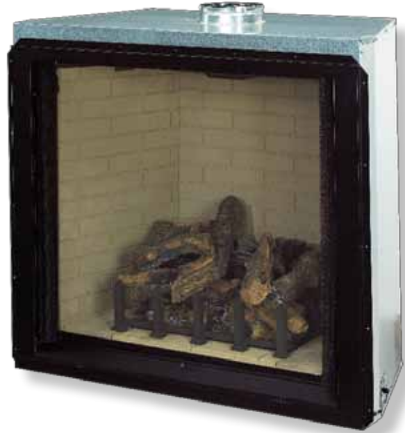
The clean-faced Stratos is available in tall, unobstructed 36" & 42" opening widths.

The top, direct vent configuration of the Stratos provides a wide variety of convenient venting options using our 5" / 8" coaxial chimney system. The solid steel chassis face includes heavy, continuous nailing flanges and drywall stops around the face frame for solid installation, and includes a tough, textured powder coat finish.