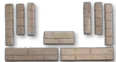
The Stratos' perimeter brick surround kit is a popular accessory.

Vantage Hearth also offers a complete line of vent-free gas hearth products featuring a full line of Vent-Free Gas Log Heaters, Classic Hearth Gas Fireplace Systems, Fireplace Inserts, Cast Iron Gas Stoves and LogMate Fireboxes. A complete selection of Direct-Vent and B-Vent Fireplaces, Cast Iron Stoves and Wood Burning Fireplaces is also available.