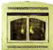
Classic faces available for GCUF/GRUF/MCUF fireboxes