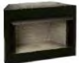
BUF500 vent free firebox