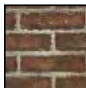
Cottage Red firebrick