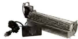
Variable speed blower optional