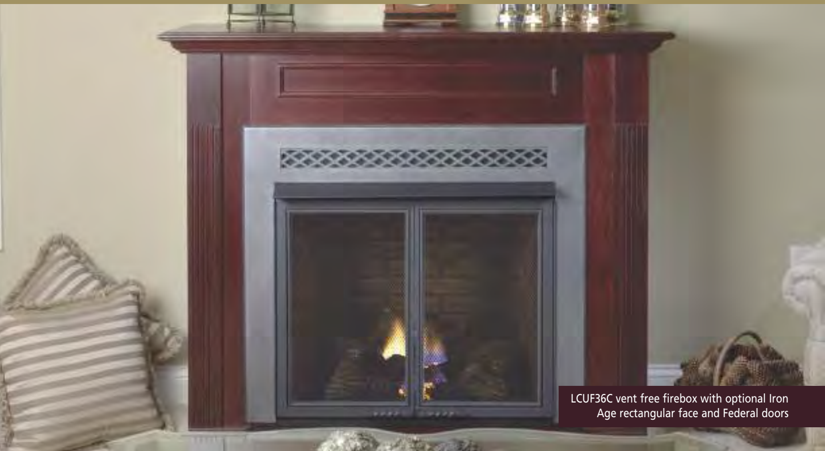
LCUF36C vent free firebox with optional Iron Age rectangular face and Federal doors