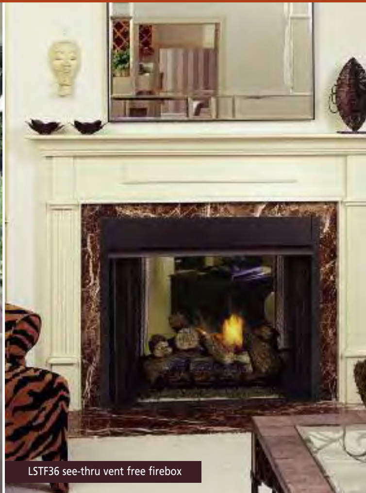
LSTF36 see-thru vent free firebox