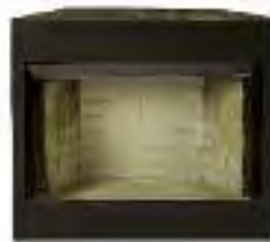
BUF400 vent free firebox