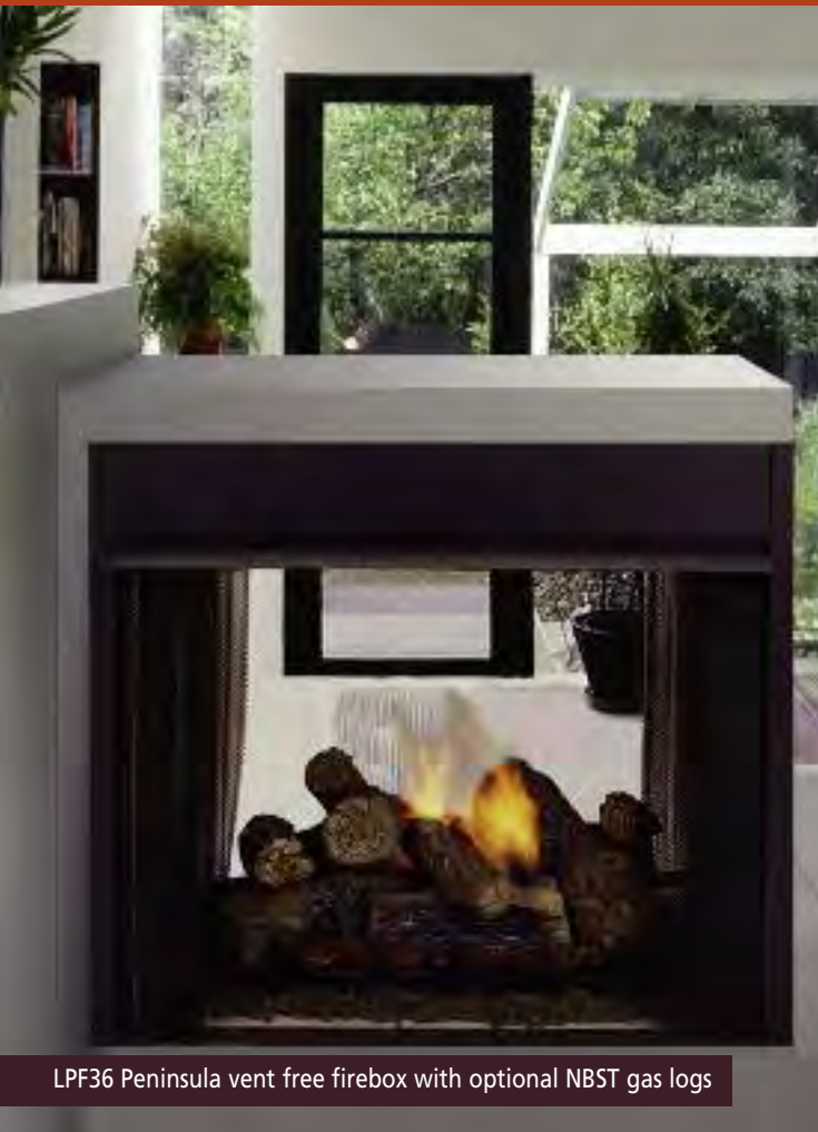
LPF36 Peninsula vent free firebox with optional NBST gas logs