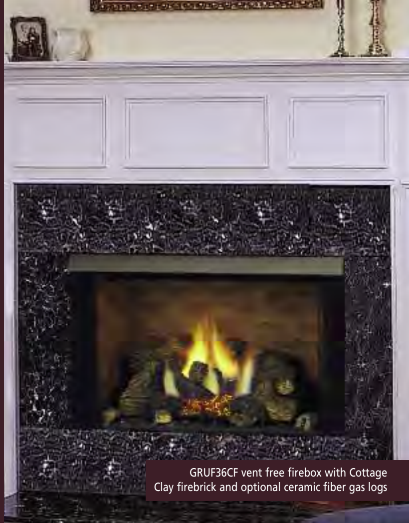
GRUF36CF vent free firebox with Cottage Clay firebrick and optional ceramic fiber gas logs

Nothing invites or delights like the dancing flames of a fire. For thousands of years fire has been the focal point of hearth and home and, like so many families before, we invite you to sit by ours and enjoy their warmth and beauty.