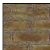
Cottage Clay firebrick