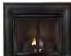
Manor faces available for GCUF/GRUF fireboxes