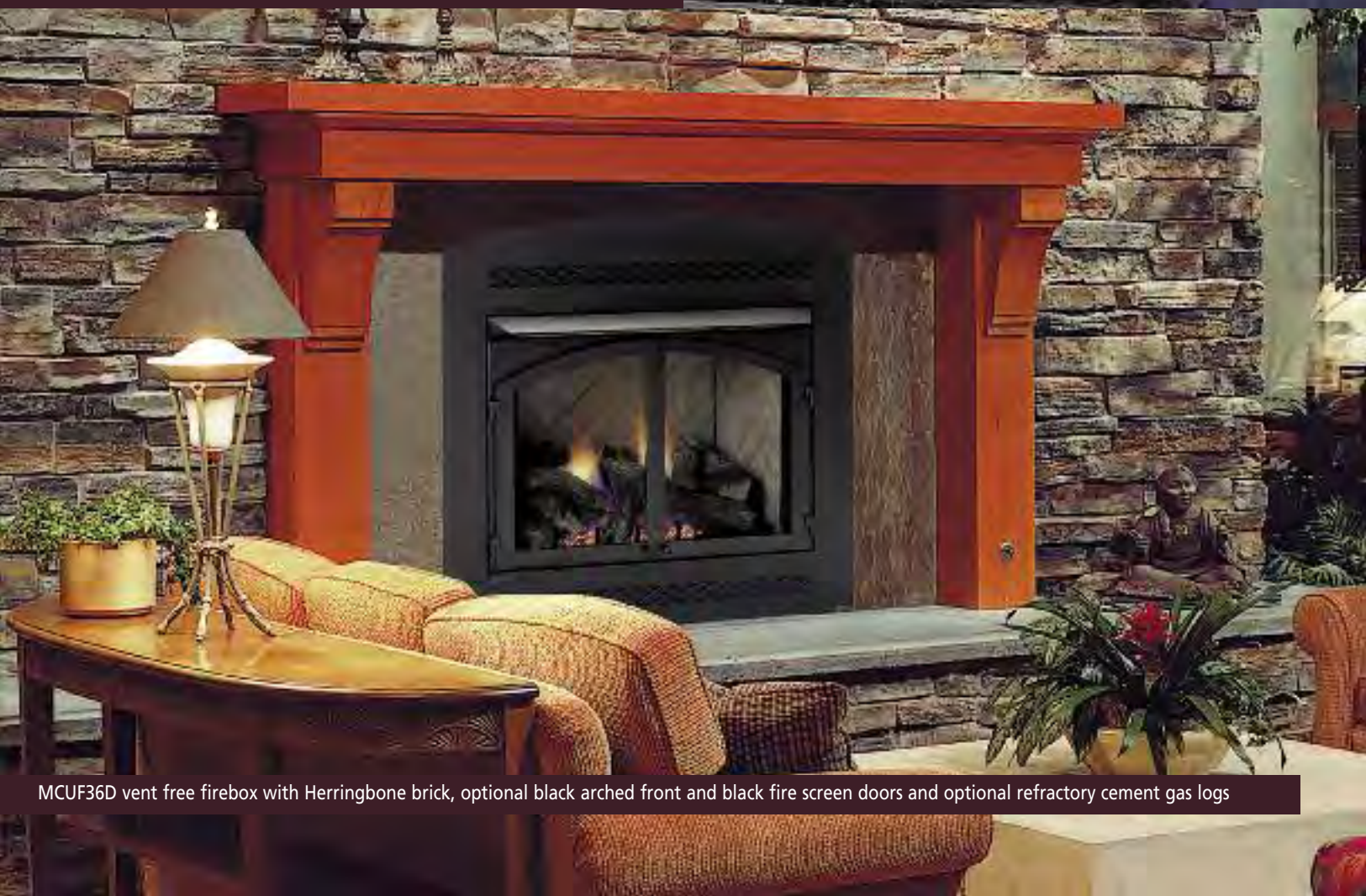
MCUF36D vent free firebox with Herringbone brick, optional black arched front and black fire screen doors and optional refractory cement gas logs