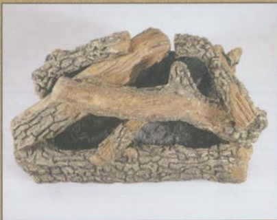
Solid, unitized log set is intricately detailed