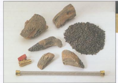
Standard feature components